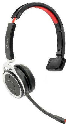
VT9605 BT Mono