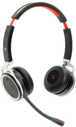
VT9605 BT Duo